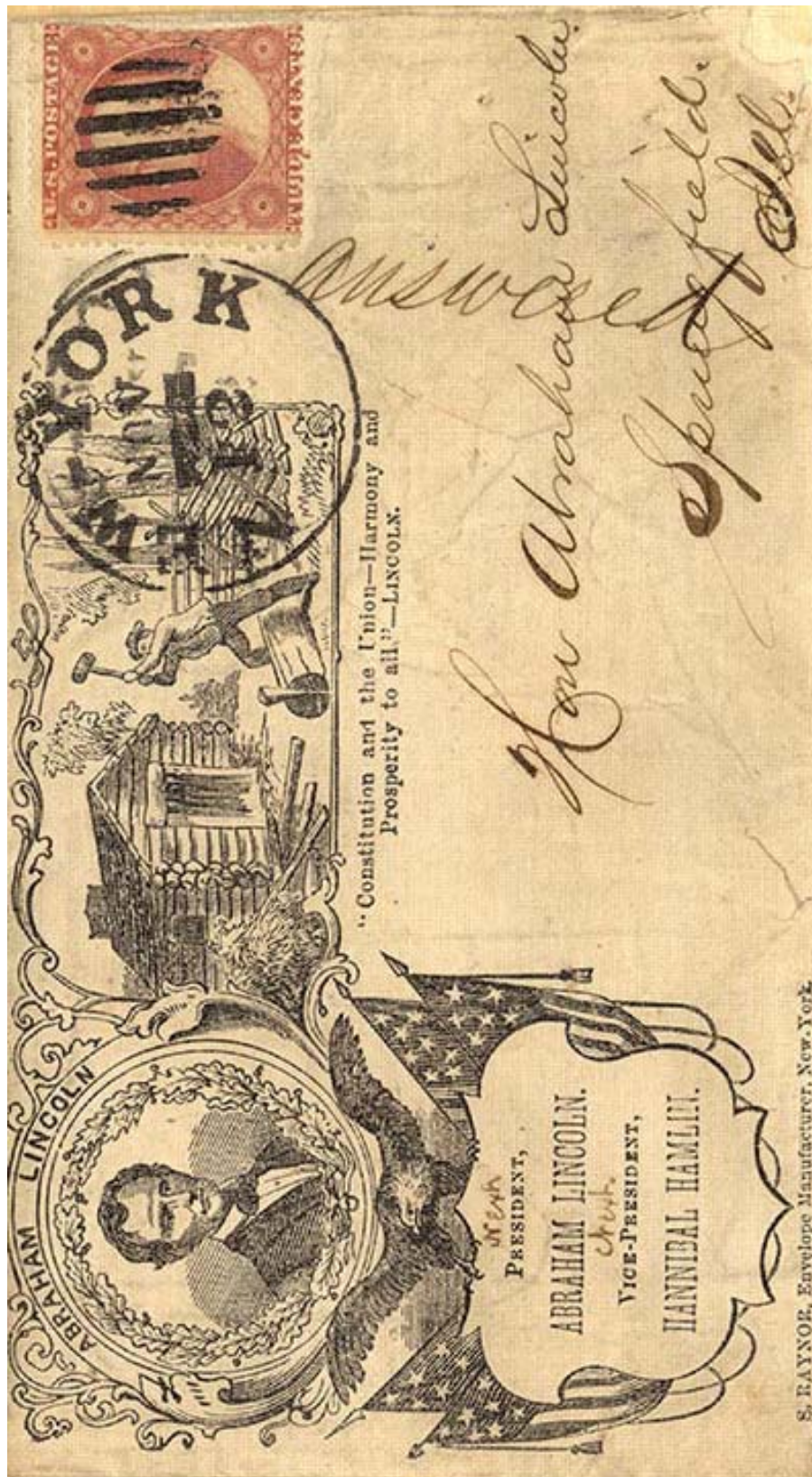
On loan from the Detroit Public Library, Burton Historical Collection (069, Grace Bedell to Lincoln)